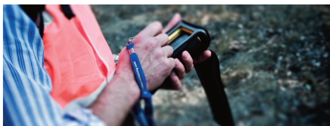
The Custodial Officer agrees standards for data collection

The Custodial Officer is then responsible for the ongoing collection, storage, maintenance and supply of the dataset. He or she is the key point of contact, the “authoritative source” of information about that dataset.